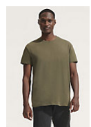
SOL'S REGENT 11380